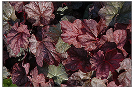
Beaujolais Hairy Alumroot foliage