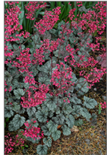
Rave On Coral Bells in bloom

Rave On Coral Bells is recommended for the following landscape applications;