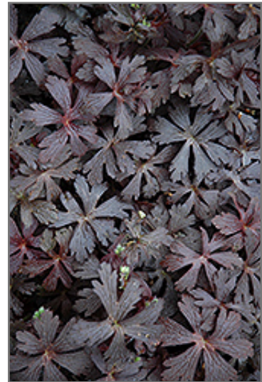
Espresso Cranesbill foliage