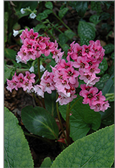
Pink Dragonfly Bergenia flowers