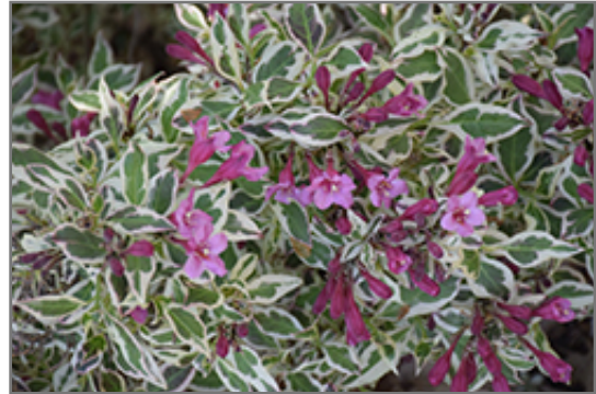
My Monet Weigela flowers

My Monet Weigela is recommended for the following landscape applications;