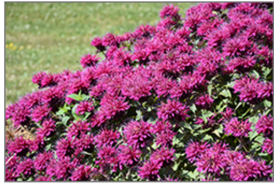
Grand Marshall Beebalm flowers

Grand Marshall Beebalm is recommended for the following landscape applications;