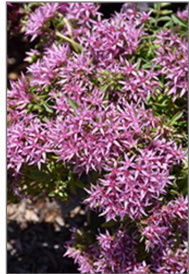
Spot On Pink Stonecrop flowers