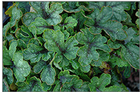
Dayglow Pink Foamy Bells foliage