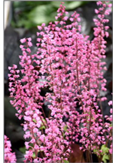
Dayglow Pink Foamy Bells flowers

Dayglow Pink Foamy Bells is a fine choice for the garden, but it is also a good selection for planting in outdoor pots and containers. It is often used as a 'filler' in the 'spiller-thriller-filler' container combination, providing a mass of flowers and foliage against which the larger thriller plants stand out. Note that when growing plants in outdoor containers and baskets, they may require more frequent waterings than they would in the yard or garden.