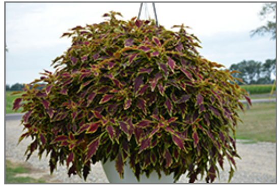
FlameThrower Serrano Coleus

FlameThrower Serrano Coleus will grow to be about 18 inches tall at maturity, with a spread of 16 inches. When grown in masses or used as a bedding plant, individual plants should be spaced approximately 15 inches apart. Although it's not a true annual, this fast-growing plant can be expected to behave as an annual in our climate if left outdoors over the winter, usually needing replacement the following year. As such, gardeners should take into consideration that it will perform differently than it would in its native habitat.