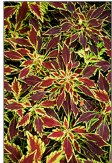
FlameThrower Serrano Coleus foliage

FlameThrower Serrano Coleus is recommended for the following landscape applications;