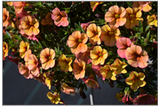
MiniFamous Uno Orange + Red Vein Calibrachoa flowers

This plant will require occasional maintenance and upkeep. Trim off the flower heads after they fade and die to encourage more blooms late into the season. It is a good choice for attracting bees and hummingbirds to your yard, but is not particularly attractive to deer who tend to leave it alone in favor of tastier treats. It has no significant negative characteristics.