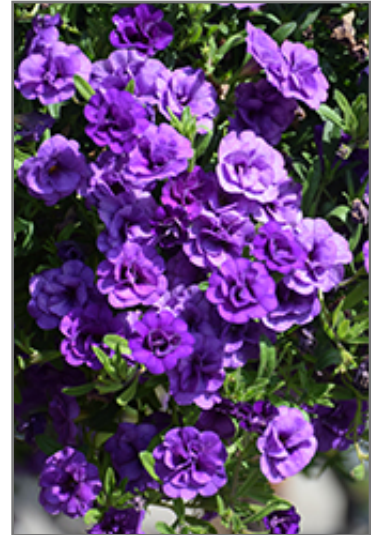
MiniFamous Neo Double Silver Blue Calibrachoa flowers

MiniFamous Neo Double Silver Blue Calibrachoa is a dense herbaceous annual with a trailing habit of growth, eventually spilling over the edges of hanging baskets and containers. Its medium texture blends into the garden, but can always be balanced by a couple of finer or coarser plants for an effective composition.