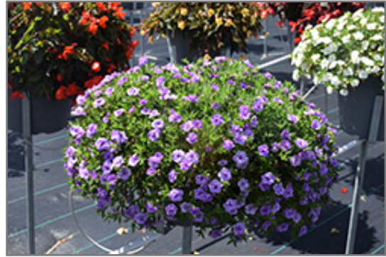
MiniFamous Neo Double Silver Blue Calibrachoa in bloom