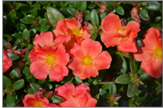
Pazzaz Orange Flare Portulaca flowers

Pazzaz Orange Flare Portulaca is recommended for the following landscape applications;