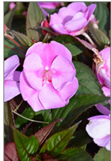
SunPatiens Vigorous Lavender Splash New Guinea Impatiens flowers