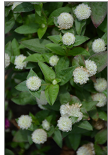
Ping Pong White Globe Amaranth flowers

The Original Family-Owned Garden Center 4320 Bridgeboro Road Moorestown, NJ 08057 Garden Center: (856) 461-0567 Landscaping: (856) 461-3359