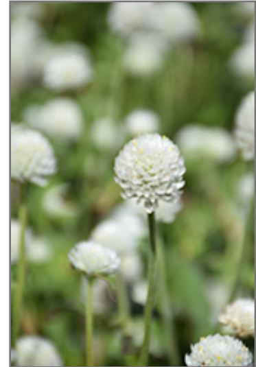
Ping Pong White Globe Amaranth flowers

Ping Pong White Globe Amaranth is recommended for the following landscape applications;