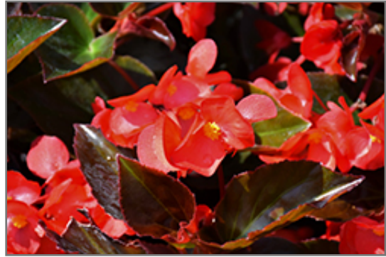
Big DeLuXXE Red Bronze Leaf Begonia flowers