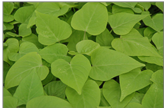
Sweet Caroline Sweetheart Light Green Sweet Potato Vine foliage