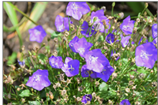
Violet Teacups Bellflower flowers

The Original Family-Owned Garden Center 4320 Bridgeboro Road Moorestown, NJ 08057 Garden Center: (856) 461-0567 Landscaping: (856) 461-3359