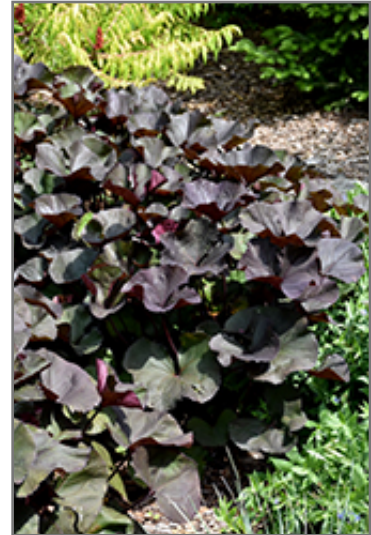
Britt Marie Crawford Rayflower foliage

This plant does best in partial shade to shade. It prefers to grow in moist to wet soil, and will even tolerate some standing water. It is not particular as to soil pH, but grows best in rich soils. It is somewhat tolerant of urban pollution. This is a selected variety of a species not originally from North America. It can be propagated by division; however, as a cultivated variety, be aware that it may be subject to certain restrictions or prohibitions on propagation.