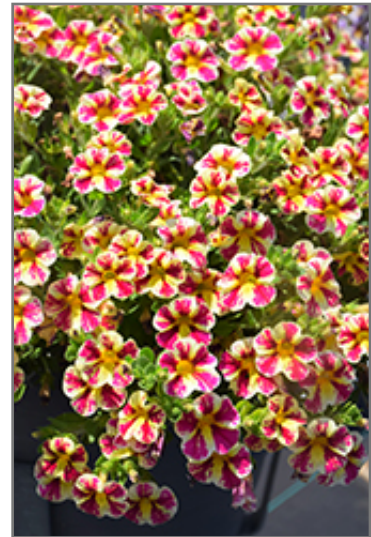
Superbells Holy Moly! Calibrachoa flowers

This plant will require occasional maintenance and upkeep. Trim off the flower heads after they fade and die to encourage more blooms late into the season. It is a good choice for attracting bees and hummingbirds to your yard, but is not particularly attractive to deer who tend to leave it alone in favor of tastier treats. It has no significant negative characteristics.