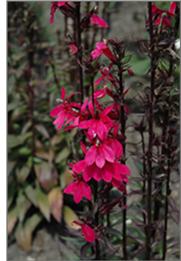
Starship Deep Rose Lobelia flowers

Starship Deep Rose Lobelia is recommended for the following landscape applications;