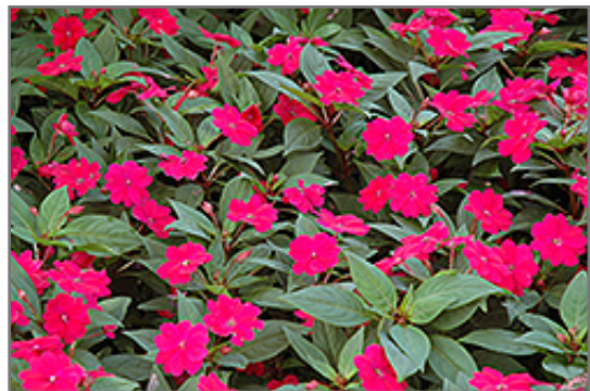
Bounce Cherry Impatiens in bloom

The Original Family-Owned Garden Center 4320 Bridgeboro Road Moorestown, NJ 08057 Garden Center: (856) 461-0567 Landscaping: (856) 461-3359