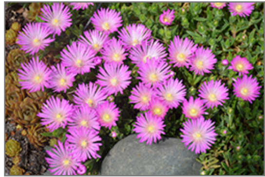
Table Mountain Ice Plant flowers

Table Mountain Ice Plant is recommended for the following landscape applications;