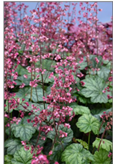
Berry Timeless Coral Bells flowers

The Original Family-Owned Garden Center 4320 Bridgeboro Road Moorestown, NJ 08057 Garden Center: (856) 461-0567 Landscaping: (856) 461-3359