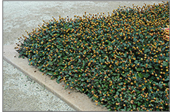
Peek A Boo Para Cress in bloom