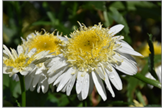
Reaflor Real Glory Shasta Daisy flowers

Reaflor Real Glory Shasta Daisy is recommended for the following landscape applications;