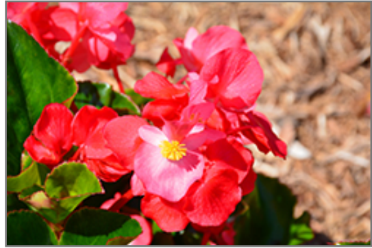
Whopper Rose Green Leaf Begonia flowers

This is a high maintenance plant that will require regular care and upkeep, and usually looks its best without pruning, although it will tolerate pruning. Deer don't particularly care for this plant and will usually leave it alone in favor of tastier treats. Gardeners should be aware of the following characteristic(s) that may warrant special consideration;