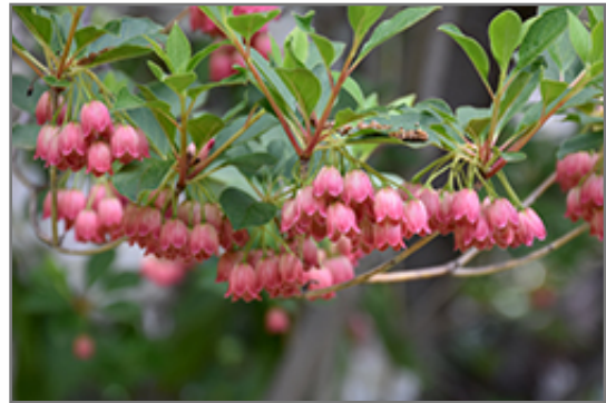
Redvein Enkianthus flowers