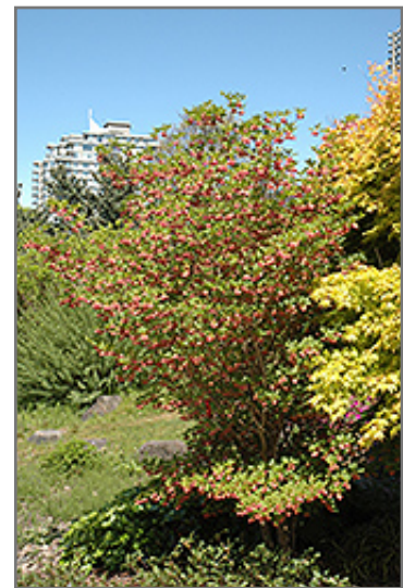
Redvein Enkianthus in bloom

The Original Family-Owned Garden Center 4320 Bridgeboro Road Moorestown, NJ 08057 Garden Center: (856) 461-0567 Landscaping: (856) 461-3359