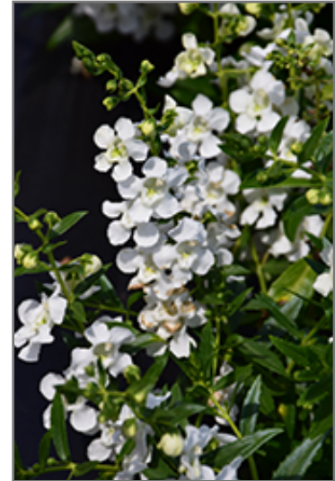
AngelMist Spreading White Angelonia flowers

This plant will require occasional maintenance and upkeep, and should not require much pruning, except when necessary, such as to remove dieback. It is a good choice for attracting butterflies to your yard, but is not particularly attractive to deer who tend to leave it alone in favor of tastier treats. It has no significant negative characteristics.