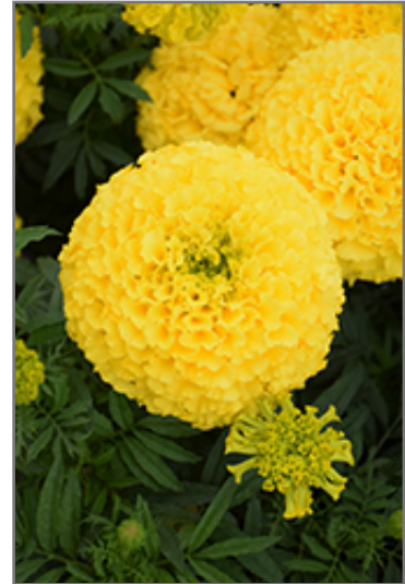
Marvel Yellow Marigold flowers

Marvel Yellow Marigold is recommended for the following landscape applications;