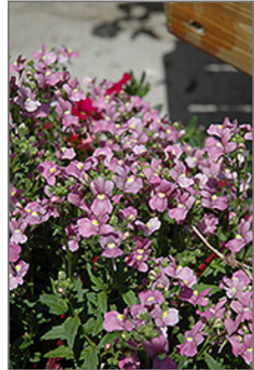
Compact Pink Innocence Nemesia flowers