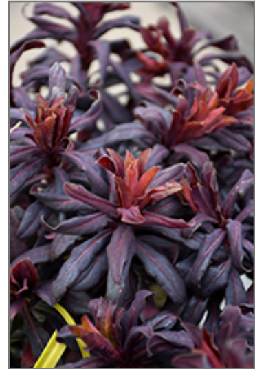
Ruby Glow Wood Spurge flowers

Ruby Glow Wood Spurge is recommended for the following landscape applications;