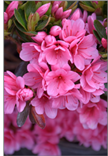
Coral Bells Azalea flowers