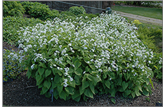
Perennial Money Plant in bloom

Perennial Money Plant is recommended for the following landscape applications;