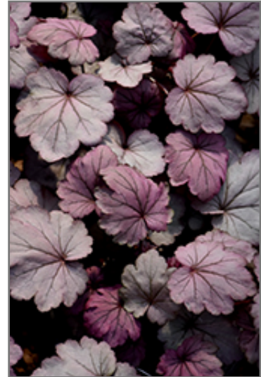
Sugar Plum Coral Bells foliage

Sugar Plum Coral Bells is recommended for the following landscape applications;