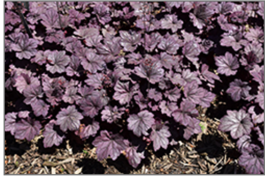
Sugar Plum Coral Bells

Sugar Plum Coral Bells will grow to be about 12 inches tall at maturity extending to 24 inches tall with the flowers, with a spread of 18 inches. When grown in masses or used as a bedding plant, individual plants should be spaced approximately 15 inches apart. Its foliage tends to remain dense right to the ground, not requiring facer plants in front. It grows at a medium rate, and under ideal conditions can be expected to live for approximately 10 years. As an evergreen perennial, this plant will typically keep its form and foliage year-round.