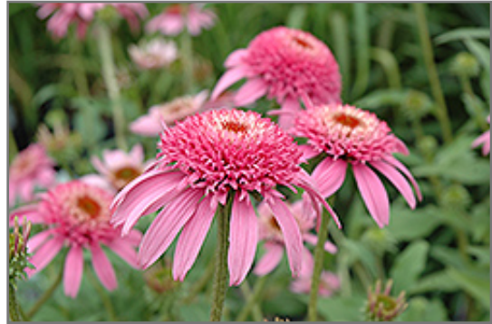
Cone-fections Pink Double Delight Coneflower flowers

Cone-fections Pink Double Delight Coneflower is recommended for the following landscape applications;