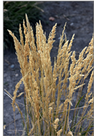
El Dorado Feather Reed Grass fruit

El Dorado Feather Reed Grass is a fine choice for the garden, but it is also a good selection for planting in outdoor pots and containers. Because of its height, it is often used as a 'thriller' in the 'spiller-thriller-filler' container combination; plant it near the center of the pot, surrounded by smaller plants and those that spill over the edges. It is even sizeable enough that it can be grown alone in a suitable container. Note that when growing plants in outdoor containers and baskets, they may require more frequent waterings than they would in the yard or garden.