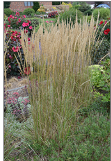
El Dorado Feather Reed Grass

El Dorado Feather Reed Grass is recommended for the following landscape applications;