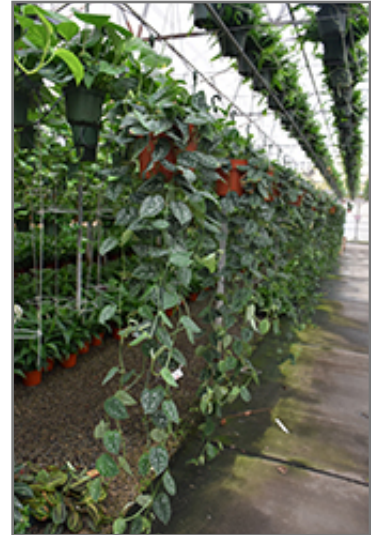
Argyraeus Pothos in full

-- THIS IS A TROPICAL PLANT AND SHOULD NOT BE EXPECTED TO SURVIVE THE WINTER OUTDOORS IN OUR CLIMATE --