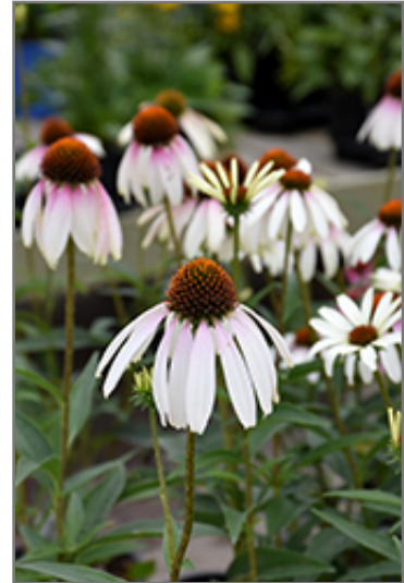
Pretty Parasols Coneflower flowers

Pretty Parasols Coneflower is recommended for the following landscape applications;