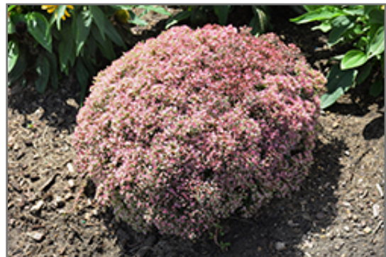
Rock 'N Round Pride and Joy Stonecrop in bloom