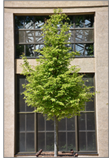
Persian Parrotia