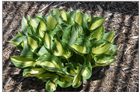
Morning Light Hosta