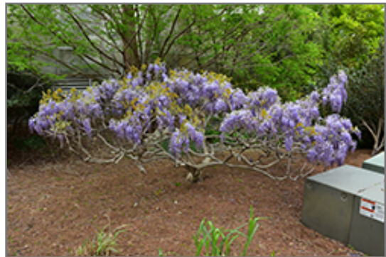
Japanese Wisteria in bloom