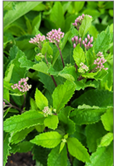
Phantom Joe Pye Weed flower buds