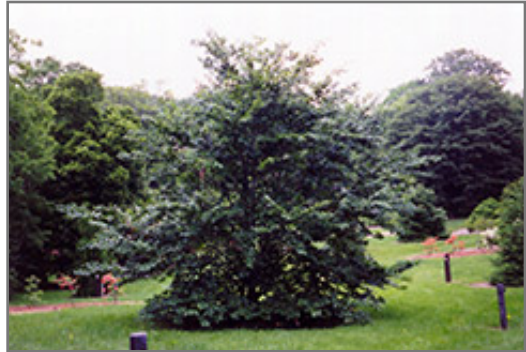
American Beech