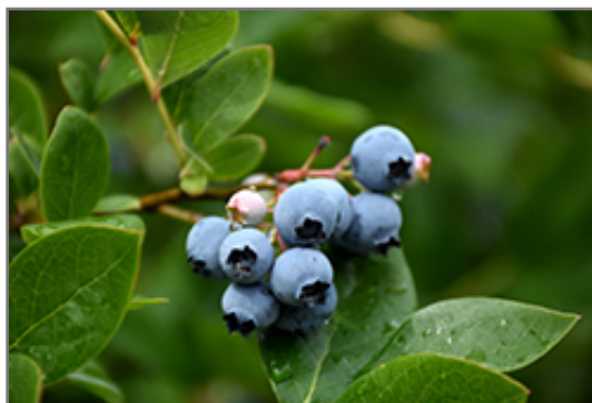
Northcountry Blueberry fruit

Northcountry Blueberry features dainty clusters of white bell-shaped flowers with shell pink overtones hanging below the branches in mid spring. It has green deciduous foliage. The glossy oval leaves turn an outstanding scarlet in the fall. It features an abundance of magnificent blue berries in mid summer.