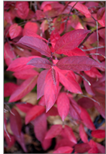
Henry's Garnet Virginia Sweetspire in fall

This shrub performs well in both full sun and full shade. It is an amazingly adaptable plant, tolerating both dry conditions and even some standing water. It is not particular as to soil type or pH. It is somewhat tolerant of urban pollution. This is a selection of a native North American species.