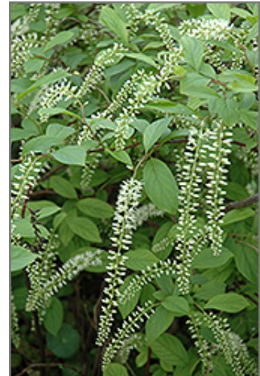
Henry's Garnet Virginia Sweetspire flowers