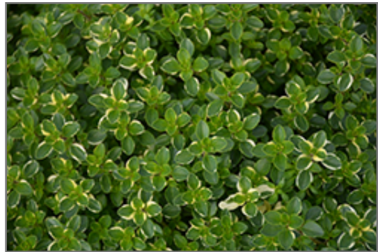
Variegated Broadleaf Thyme foliage