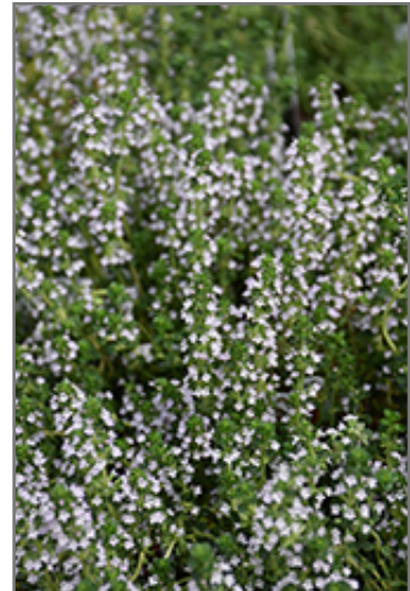
Doone Valley Thyme flowers

Doone Valley Thyme is a dense herbaceous evergreen perennial with a ground-hugging habit of growth. It brings an extremely fine and delicate texture to the garden composition and should be used to full effect.