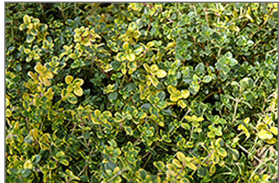
Doone Valley Thyme