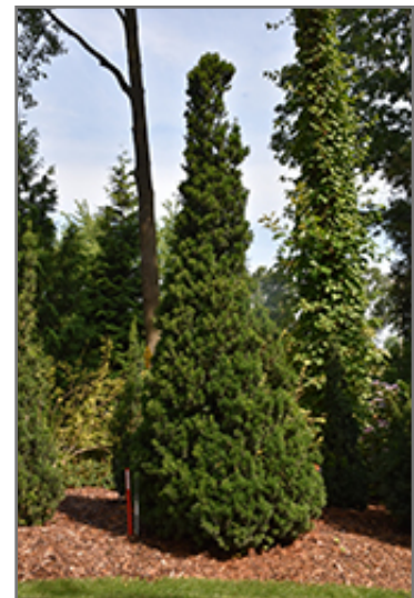
Viridis Yew