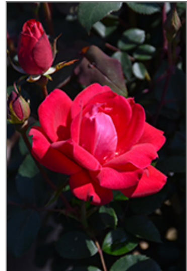
Double Knock Out Rose flowers